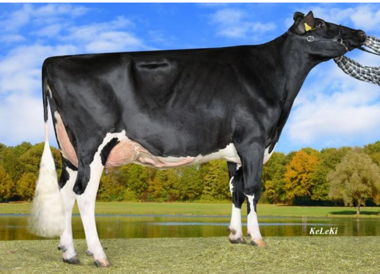
4GM: Wilder Herz P EX-90