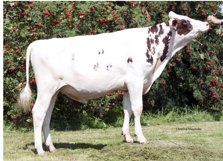
HHF Emir P Red

Emir P Red comes from an excellent cow family, which impresses with high lifetime production (M: >60,000kg, GM: >120,000kg, UGM: 98,000kg, each with very good components) and excellent classifications over generations. Emir P Red is NOT out of ET and transmits good production and excellent fitness values with good milkability. In terms of conformation, Emir convinces with good feet and legs and excellent udder transmission. With 125 udder index he is still one of the highest red, polled sires. He is also very well suited for AMS farms (RZRobot 107), can be used with heifers and also convinces with health values. Emir is not from ET.