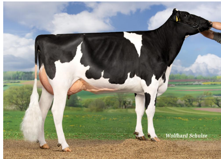
Mutter: Danhof Gameday Geiles Gerät VG-85

Bologna is a full brother of Bergamo and, like Bergamo, connects the cow families of Dellia EX 95 with Rotate Gaiety EX 90 (our perennial favorite Glamour Red also comes from this family) via his sire Bosvito, who comes from three generations of EX classified dams from the Cookiecutter MOM Halo family, with the Gameday dam, who was one of the highest breeding cattle according to TPI of her year in Europe and is now classified VG- 85 (86 udder - 86 feet & legs). Bologna's dam goes back over eight generations of VG or EX classified dams to Schillview Mtoto Gladd VG-88. Bologna himself is a very attractive all-rounder with a top performance with high components, very high longevity, very good cell values with positive milkability and excellent health values. Bologna also passes on very good conformation with lots of milk type, wide rumps, good feet & legs and excellent udder inheritance. Bologna can be used for heifer inseminations and tests Kappa-casein BB.