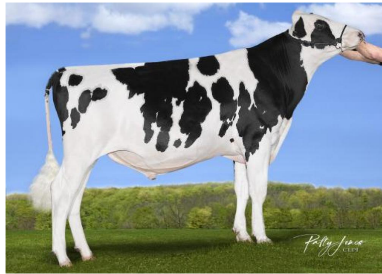
Jook Einstein QUALITY