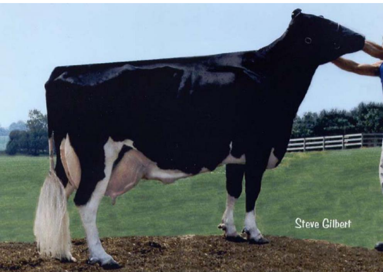
Stammkuh: Wesswood-HC Rudy Missy EX-92