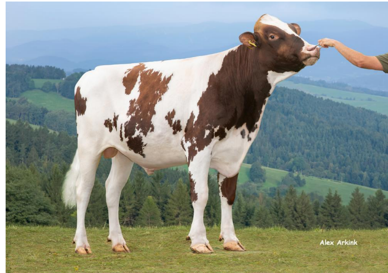
NM Reiko Red