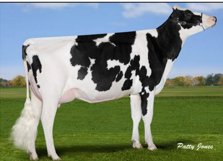
4GM Gen-I-Beq Snowman Spring VG-85