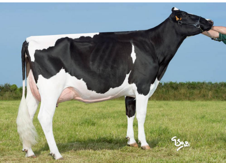
3GM: Gazelle 55 VG-86